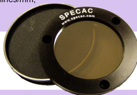
Image Quality (IQ) Infrared Polarizers (GS57010 Series) - These polarizers are offered on Ge and ZnSe substrates, in a choice of support rings. Anti-reflection coatings and a high specification of optical flatness and parallelism make these polarizers well suited for imaging applications.

High Extinction Ratio (HER) Infrared Polarizers (GS57010 Series) - These polarizers are offered on BaF 2 , CaF 2 , KRS-5, Ge, and ZnSe substrates in a choice of support rings. Manufactured at 4000 lines/mm, with an enhanced coating process, they ensure a higher degree of polarization extinction without jeopardising transmission throughput.